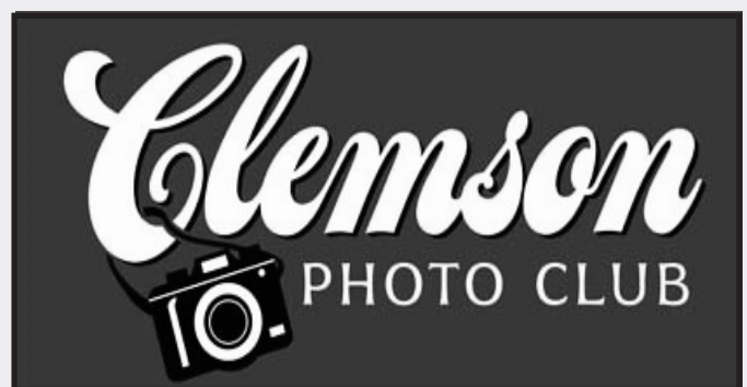
Exhibit open through January 9.

Join the Clemson Photo Club to celebrate its 15th Anniversary and its 14th Annual Member Exhibit "Carolina Nature." Hors d'oeuvres and beverages will be provided. The Clemson Photography Club was formed in 2009 by three Clemson University faculty and staff members. Membership is open to all area residents; demographics include all ages, amateurs, novices, those who are just starting to learn and current or retired photographic professionals. Members come from a wide range of backgrounds and interests. See clemsonphotoclub.com for more information.