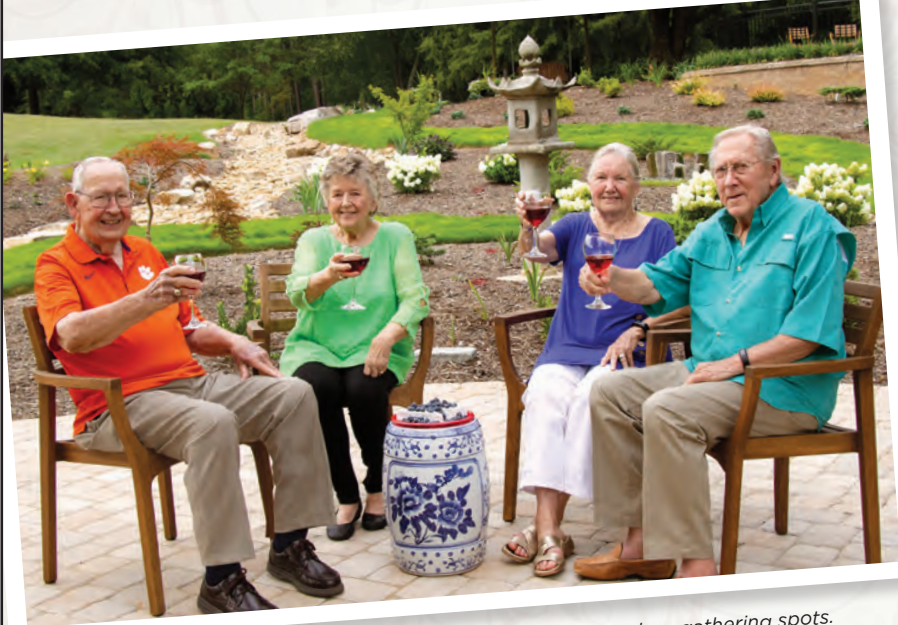
Residents enjoying time together in one of our many outdoor gathering spots.

Our residents love living life at Clemson Downs! They enjoy fun, food and fellowship on our beautiful 38-acre wooded and pastoral campus.